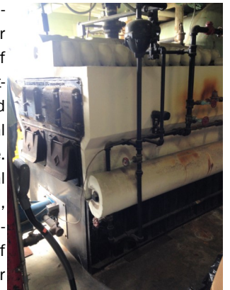
Pictured above is the boiler at Miller Ave. Elementary (the only heat source for the building) in need of being replaced. There is no backup if it were to go out.