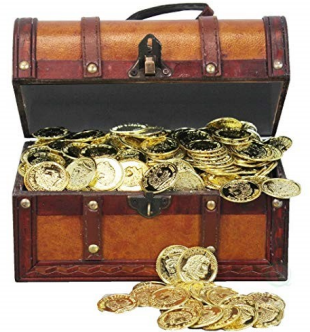
Keeping the treasure chest in the black is becoming increasingly difficult.

local property owners. Garaway is thankful for and appreciative to our citizens for their support of local property tax issues. With the upcoming change in state governor and other legislators as well as a new state biennium budget in Spring 2019, it is critical that Garaway residents contact their state representatives to remind them that their vote for school funding is needed to ensure that state revenue support is maintained or increased for small, local public schools like Garaway in towns such as Sugarcreek, Dundee, Ragersville, and Baltic, Ohio. The five-year forecast is a planning document prepared by the Treasurer and approved by the Board of Education. Forecasts are updated at least every October and throughout the year if financial conditions significantly change. It reflects three years of general operations for the General Fund, historical revenues and expenditures, as well as a forecast of the present fiscal year and four additional fiscal years. Garaway's five-year forecast can be viewed at http://fy.oecn.k12.oh.us/ .