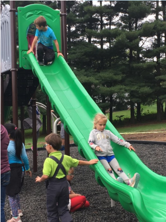
Miller Ave. Playground funded completely by donations from the community and PTO fundraisers.

At Miller and Dundee, we love to reward our students for outstanding academic progress. Each quarter, students aim to reach their Accelerated Reader points in order to obtain a specific reward. In the first quarter, we played BINGO and had a snack. In the second quarter, we'll have a game day. And in the third quarter, we'll go bowling for all students who reach their goals. Our teachers are continually working to motivate and find ways to help all students reach their highest potential.